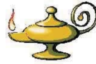
Lamp of Knowledge

Section One: Masonry at Work Section two: History & Origin of Freemasonry Section Three: Administration and Organisation Section Four: Preparing for Leadership